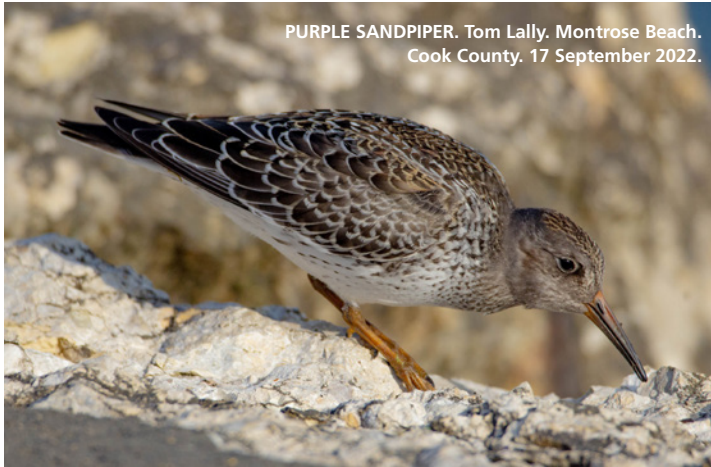
PURPLE SANDPIPER. Tom Lally. Montrose Beach. Cook County. 17 September 2022.

Purple Sandpiper ( Calidris maritima ) One juvenile at Montrose Point in Chicago's Lincoln Park, Cook County 17 September 2022 (2022-054; RDH:p; GAW:p). The juvenile plumage is rarely seen in Illinois; this may be the first documented occurrence. A photo appears in Davis (2023b).